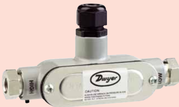
Series 629 shown with optional cable gland.